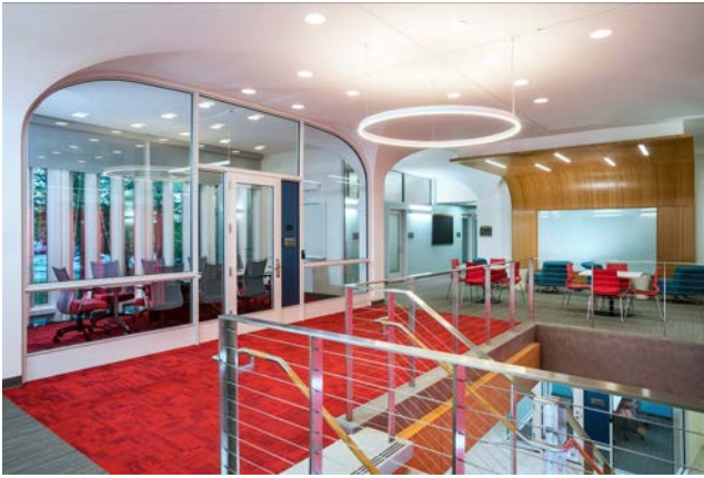
JMZ Architects and Planners, P.C. Building 25