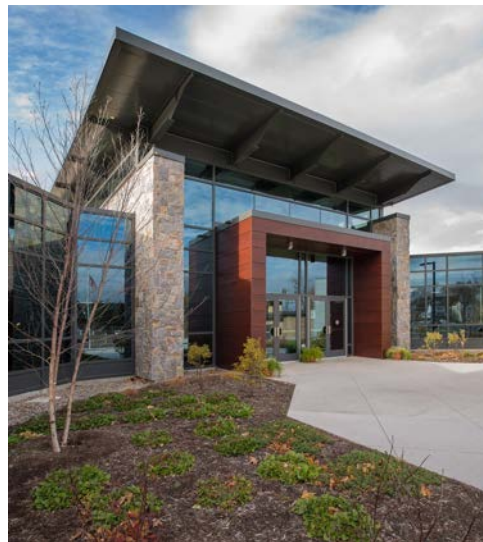
Balzer and Tuck Architecture Finger Lakes Community College Campus Center