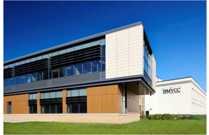
JMZ Architects and Planners, P.C. Mohawk Valley Community College, Rome Campus Transformation