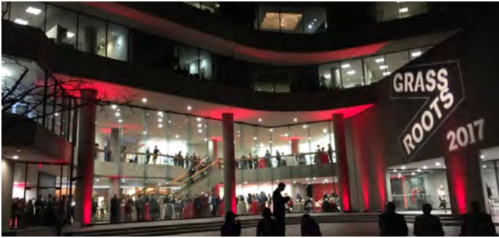
Welcome reception at the AIA National Headquarters