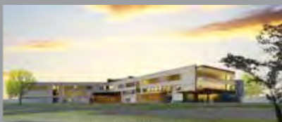
AIA ENY 2012 Merit Award Architecture+