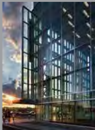
AIA ENY 2012 Honor Award EYP/ Architecture & Engineering PC