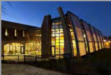
AIA ENY 2012 Merit Award Re4orm Architecture

AIA Eastern New York A Chapter of The American Institute of Architects