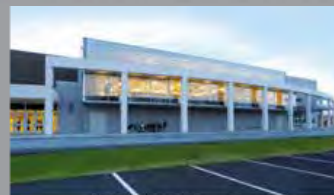
AIA ENY 2012 Honor Award CSArch PC