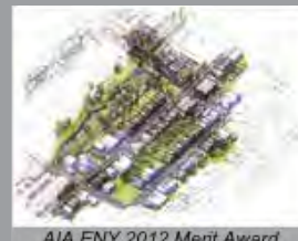
AIA ENY 2012 Merit Award 3tarchitects