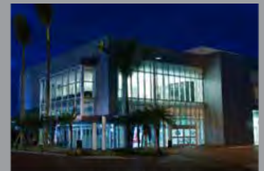
AIA ENY 2012 Merit Award Synthesis Architects, LLP